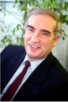
Jean-Pierre Loubinoux, Director General International Union of Railways (UIC)

The fact that the European Level Crossing Awareness Day 2009 has become the International Level Crossing Awareness Day in 2010 and the role that the UIC has played in causing this to happen, is a step of which I am especially proud.